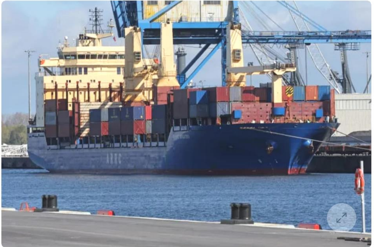
The Russian freighter "Atlantic Navigator II" is moored in the overseas port. On 04.03.2024, the freighter entered the port of Rostock for repairs due to technical problems with the propeller.