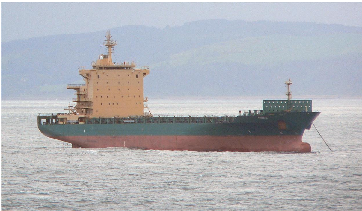
2009: Laid up at Invergordon (UK) due to the financial crisis 5/6/2009