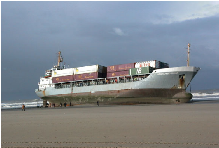
aground at Blankenberg (Belgium) November 2001

( HEINRICH BEHRMANN is trading on regular container line between the ports of Waterford, Ireland & Zeebrugge, Belgium.)