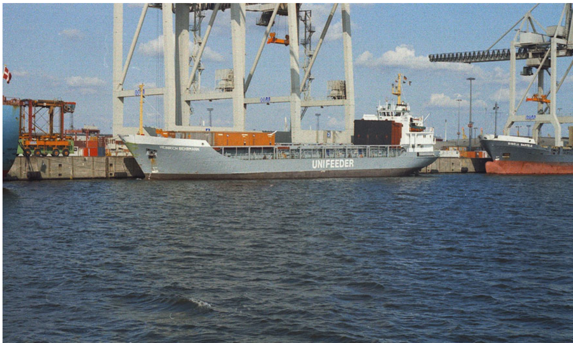
Hamburg 6/8/1994