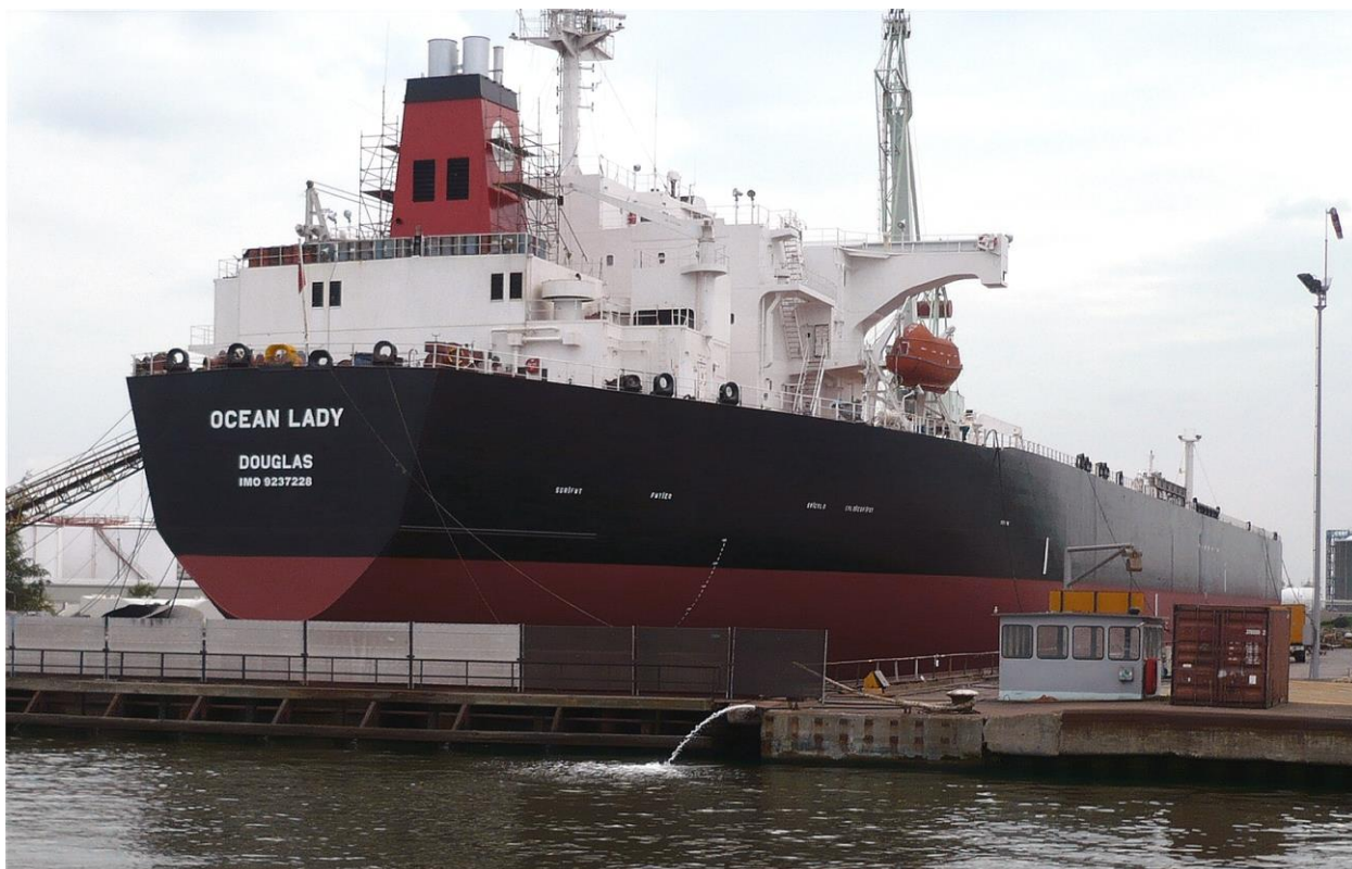
Rotterdam 2010

2012: Sold to Sinokor Merchant Marine Co Ltd, South Korea. Renamed PACIFIC BRIDGE .