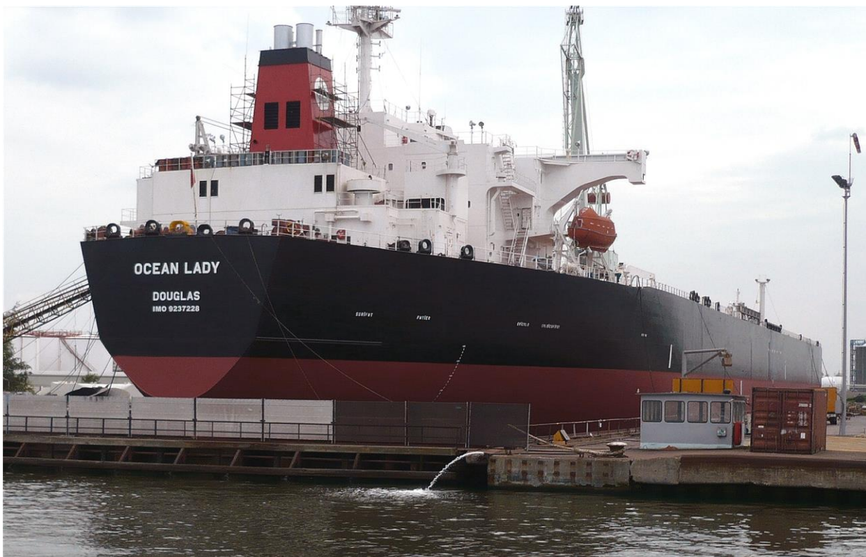
Rotterdam 2010

2012: Sold to Sinokor Merchant Marine Co Ltd, South Korea. Renamed PACIFIC BRIDGE.