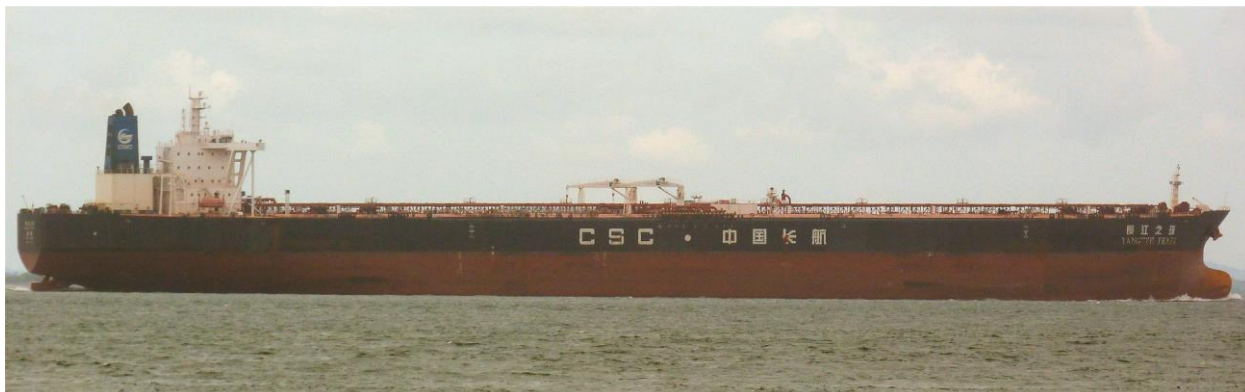
Malacca Straits (Singapore) 29/6/2011

2014: To Associated Maritime Co (H.K.) Ltd. Renamed NEW FOUNDER.