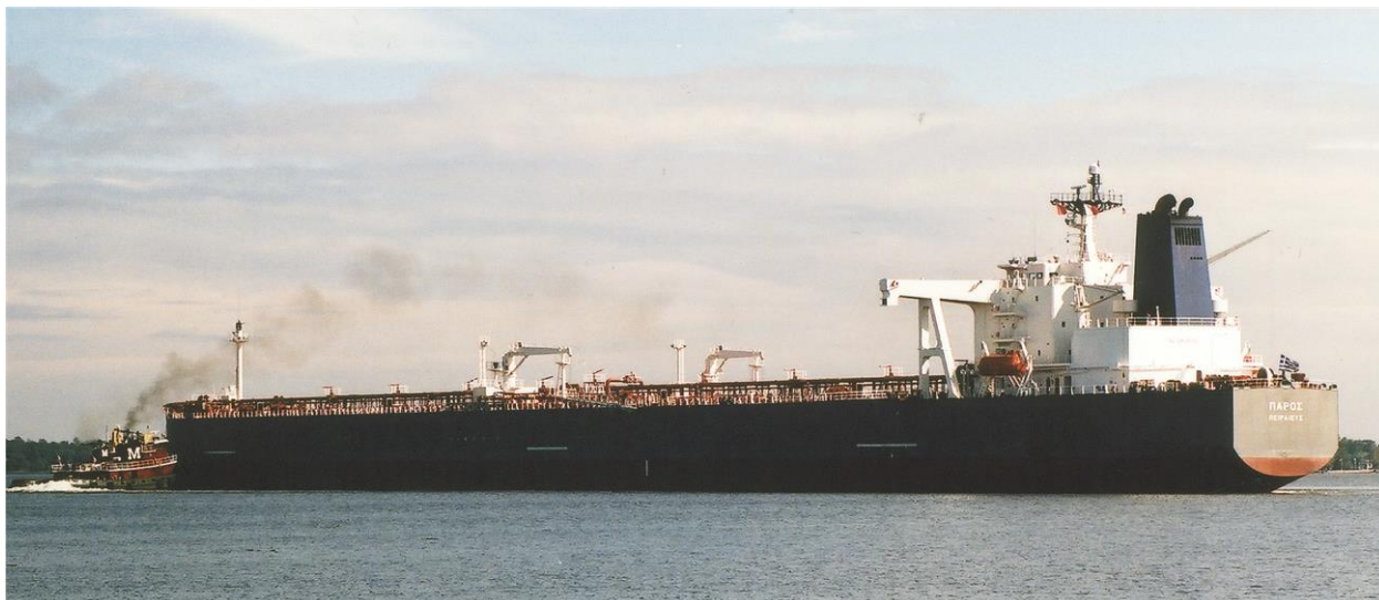
Named PAROS Delaware River 12/10/2003

2003/Dec: Sold to Ceres Hellenic Shipping, Greece. Renamed FILIKON.