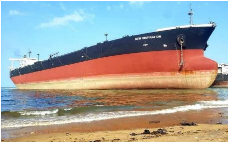
New Inspiration , Gadani, April 4, plot 123.

New Inspiration (ex- Nippon ). IMO 9237527. Double hull. Length 333 m, 40,737 t. Liberian flag. Classification society Nippon Kaiji Kyokai. Built in 2002 in Ariake (Japan) by Hitachi. Owned by Liberia-registered Symmetrical Investment Co care of New Shipping Ltd (Greece). Sold for demolition in Pakistan. 660 US$ per ton.