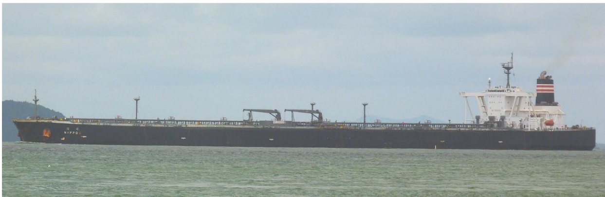
Malacca Strait (Singapore) 29/6/2011

2016: Sold to New Shipping (Adam Polemis), Greece. Renamed NEW INSPIRATION .