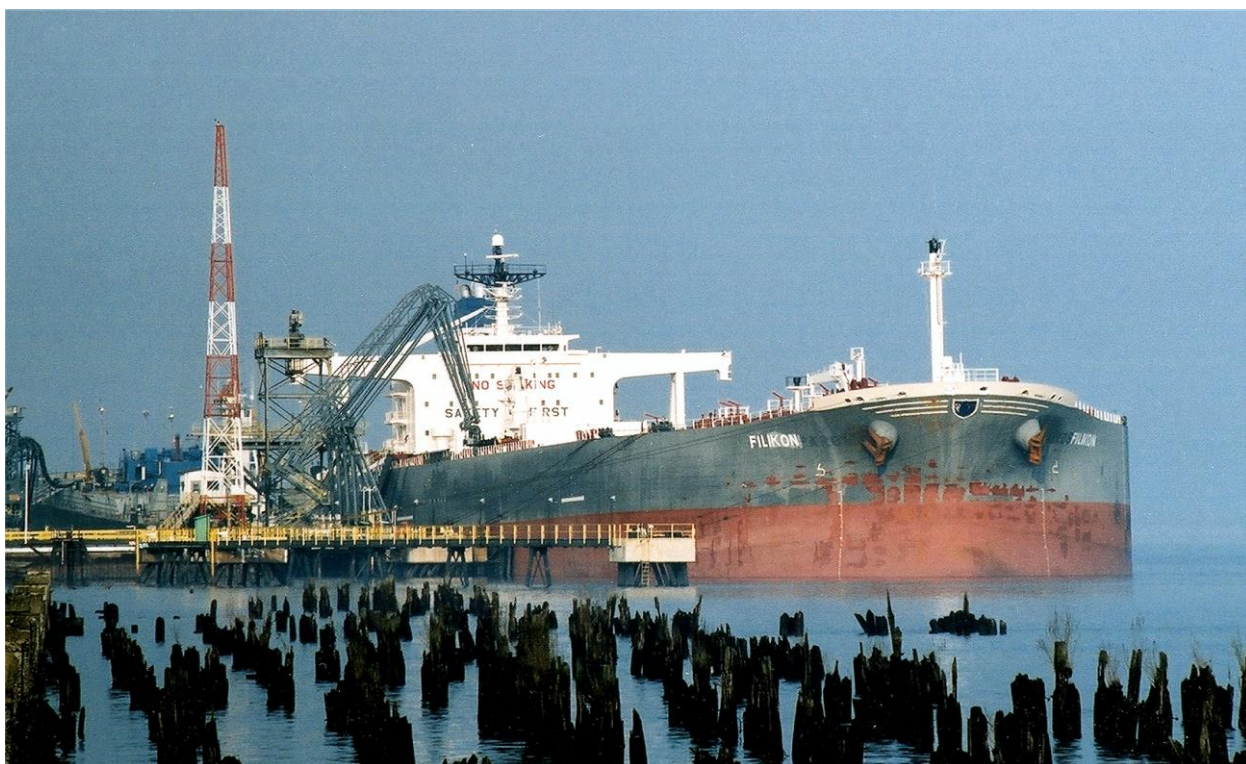
Named FILIKON Delaware River 3/9/2004

2003/Dec: Sold to Ceres Hellenic Shipping, Greece. Renamed FILIKON.