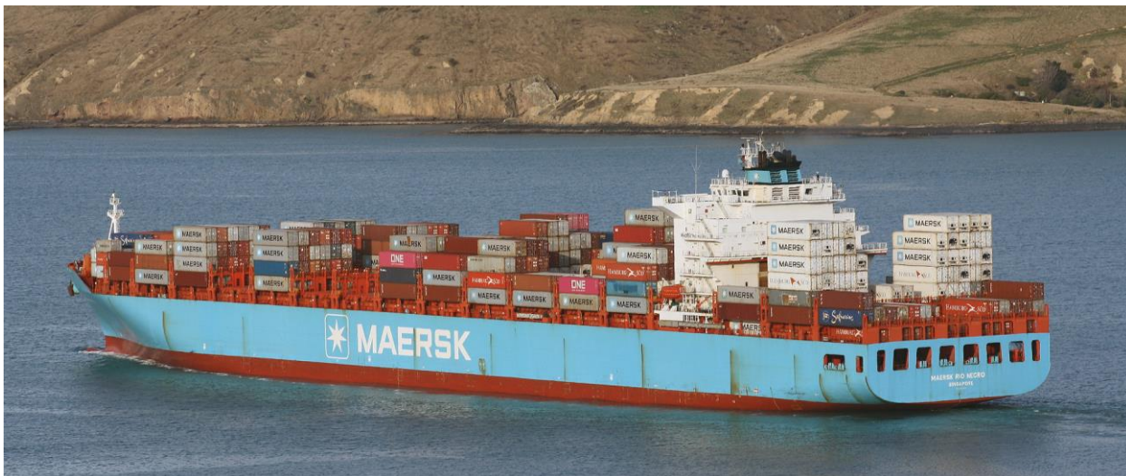
Named MAERSK RIO NEGRO Lyttelton (NZ) 27/7/2024

2023: Hamburg-Süd disappeared as part of Maersk's rebranding strategy. Renamed MAERSK RIO NEGRO.