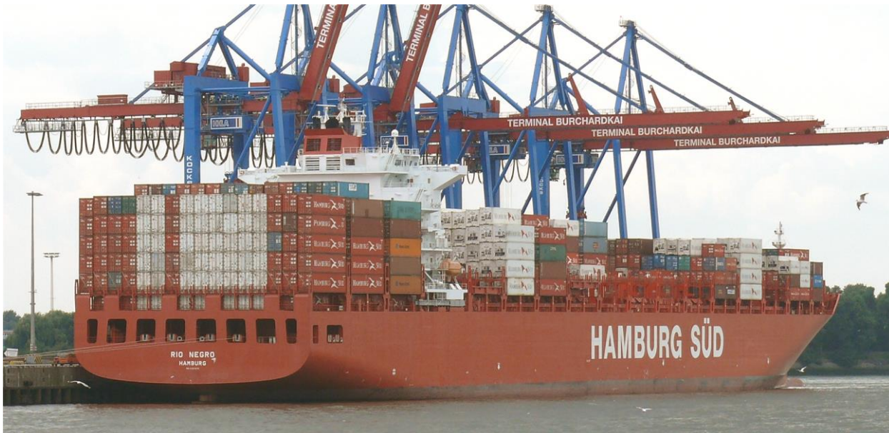
Hamburg 7/2010

2017: Hamburg-Süd became part of Maersk.