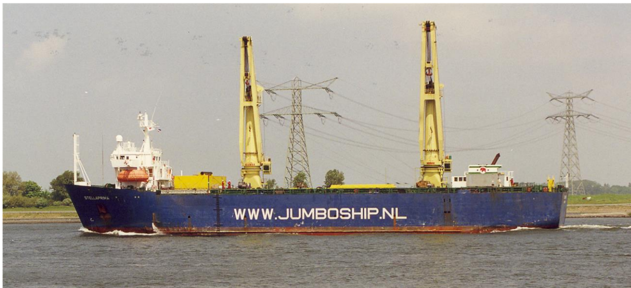
Rotterdam 15/5/2001