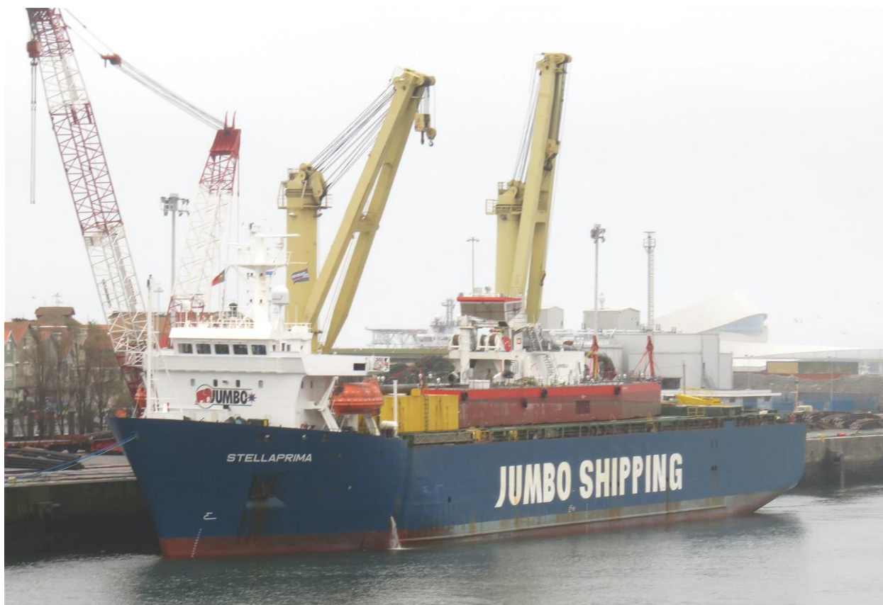
Porto 11/11/2019

2021: Sold to Alliance Shipping Ltd, Romania. Renamed PRINCESS AYANA.