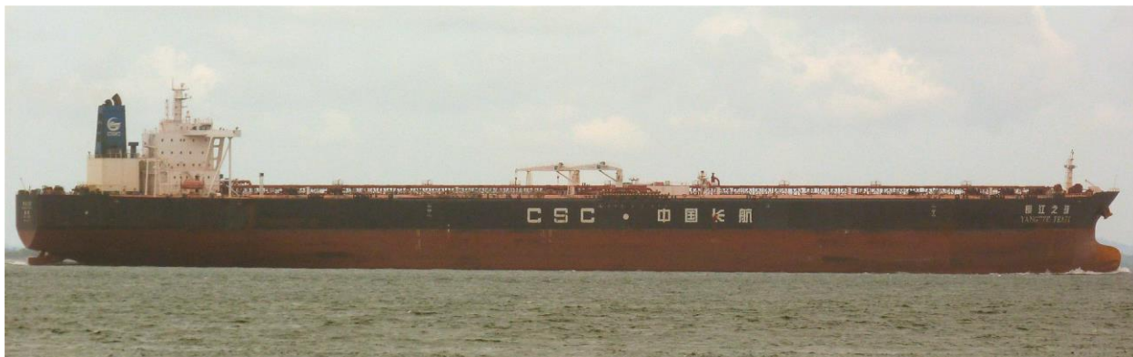
Malacca Strait (Singapore) 29/6/2011

2014: To Associated Maritime Co (HK) Ltd. Renamed NEW FOUNDER.